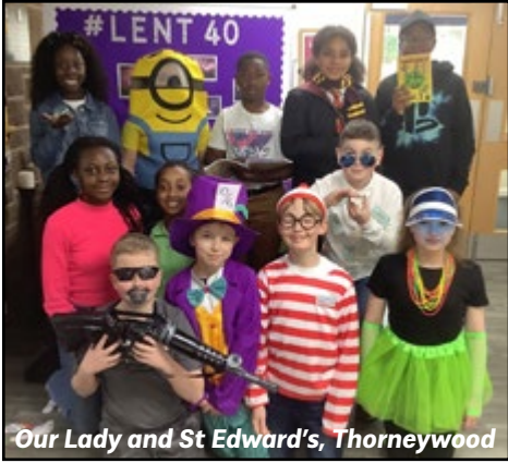
Our Lady and St Edward's, Thorneywood