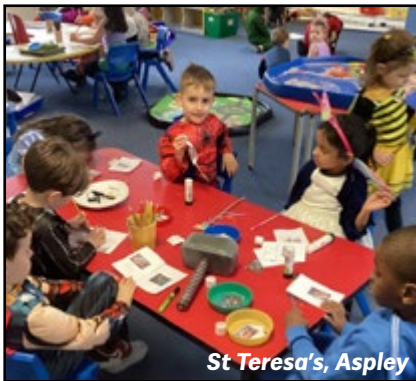
St Teresa's, Aspley