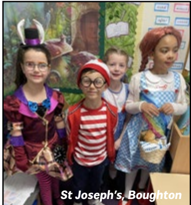
St Joseph's, Boughton