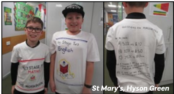
St Mary's, Hyson Green