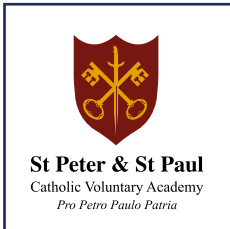
St Peter and St Paul, Lincoln: Remains a Good school