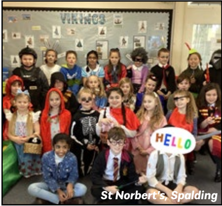
St Norbert's, Spalding