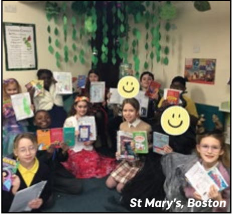
St Mary's, Boston