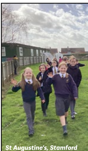
St Augustine's, Stamford

The Catholic Agency for Overseas Development (CAFOD) are an international development charity and the official aid agency of the Catholic Church in England and Wales.