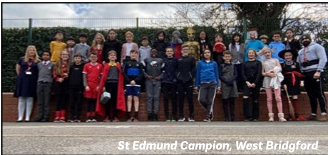
St Edmund Campion, West Bridgford