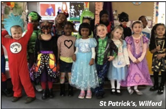
St Patrick's, Wilford