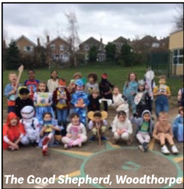
The Good Shepherd, Woodthorpe