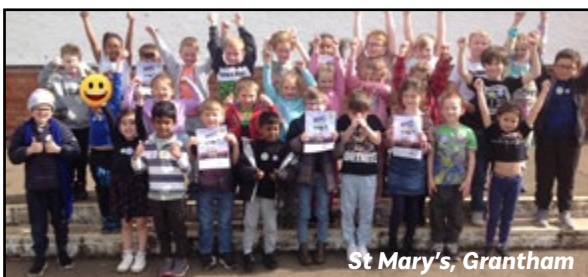
St Mary's, Grantham

It has been great to see so many of our young people out walking to raise money for such a worthwhile cause.