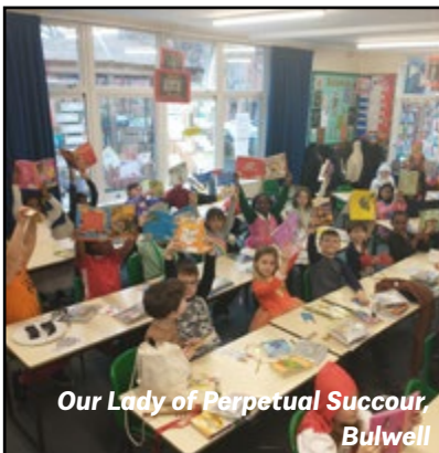
Our Lady of Perpetual Succour, Bulwell