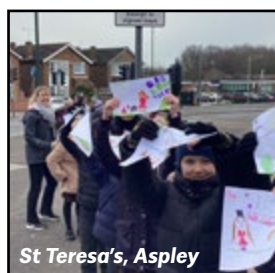
St Teresa's, Aspley