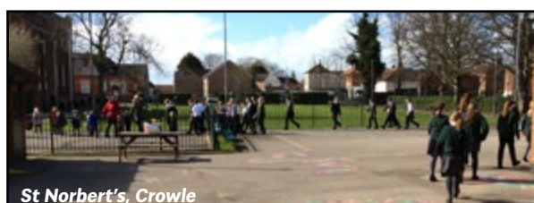
St Norbert's, Crowle

CAFOD support people living in poverty with practical help, whatever their religion or culture. Through their global church network, one of the largest in the world, they have the potential to reach everyone. They also campaign for global justice, so that every woman, man and child can live a full and dignified life.