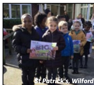
St Patrick's, Wilford