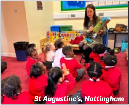
St Augustine's, Nottingham

On 2 March 2023, our academies had a fantastic World Book Day! Created by UNESCO in 1995, it is a celebration of books and reading marked in over 100 countries across the globe. Across all our academies we saw some amazing displays of creativity in costumes and activities on the day.