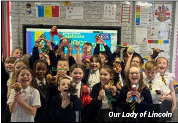
Our Lady of Lincoln