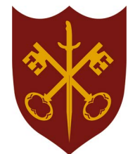
St Peter & St Paul