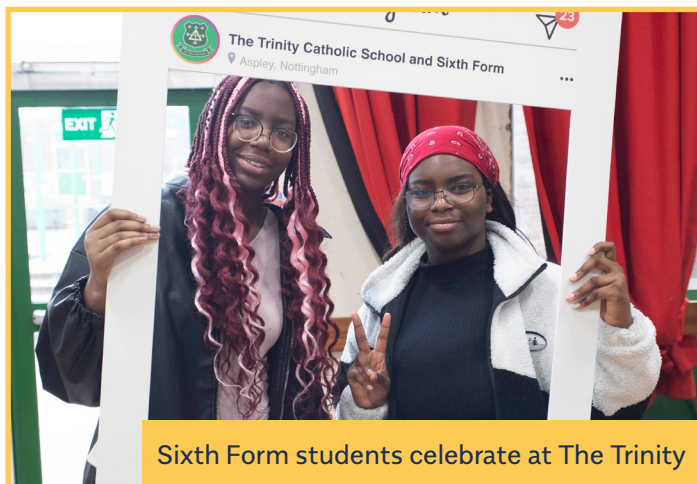
Sixth Form students celebrate at The Trinity

We were thrilled to celebrate another fantastic year of results for our students this summer.